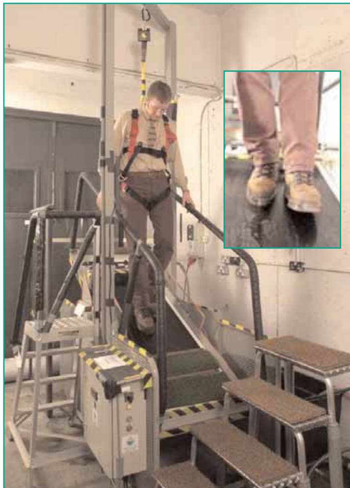
Figure 3 The 'HSL DIN ramp' coefficient of friction test

DIN 51097 involves the use of barefoot operators with soap solution as contaminant, and DIN 51130 uses heavily cleated EN345 safety boots with motor oil. HSE has reservations about these test methods, as neither uses contaminants which are representative of those commonly found in workplaces.