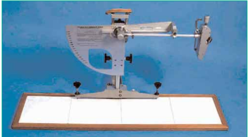
Figure 1 The 'pendulum' coefficient of friction test, HSE/HSL's preferred test method for the assessment of floor surface coefficient of friction

This instrument, although often used in its current form to assess the skid resistance of roads, was originally designed to simulate the action of a slipping foot. The method is based on a swinging, dummy heel (using a standardised rubber soling sample), which sweeps over a set area of flooring in a controlled manner. The slipperiness of the flooring has a direct and measurable effect on the pendulum value given (known as the 'slip resistance value', 'pendulum test value' or 'British pendulum number').